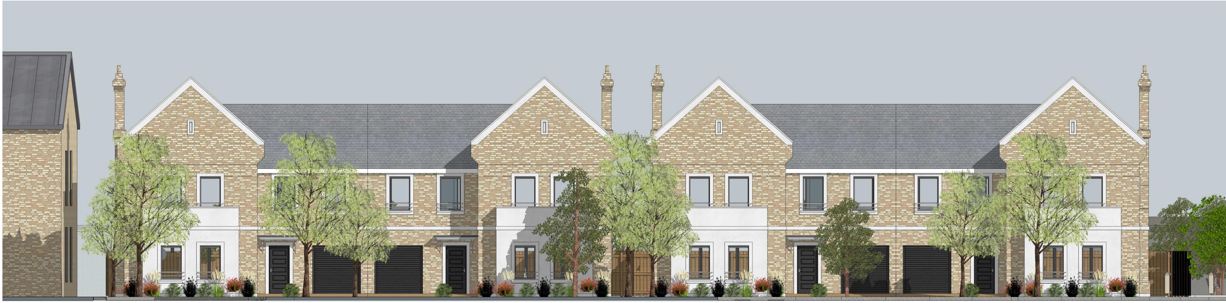
1 Proposed Front Elevation