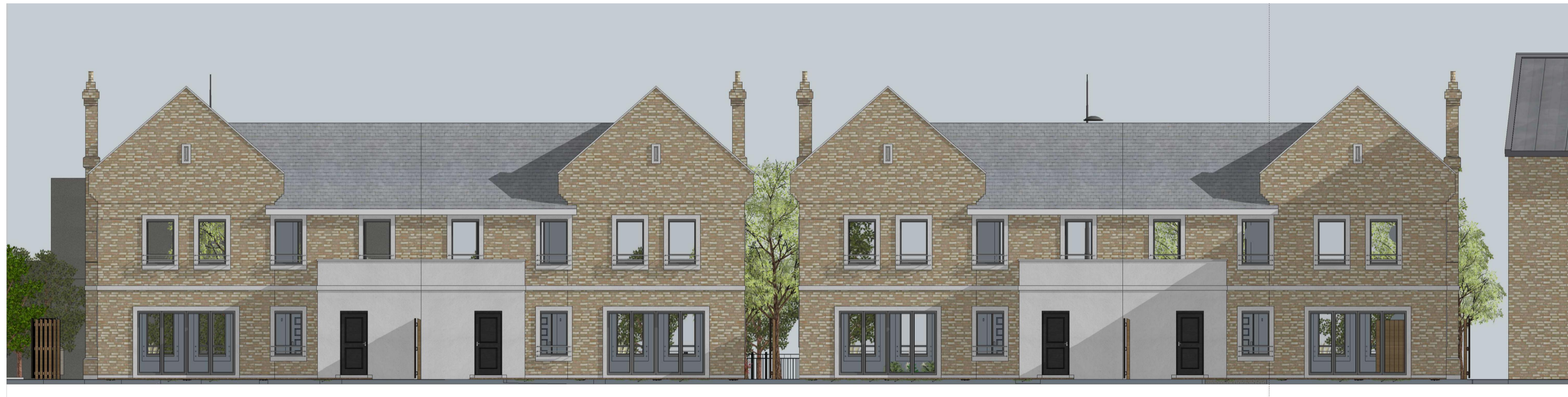
2 Proposed Rear Elevation