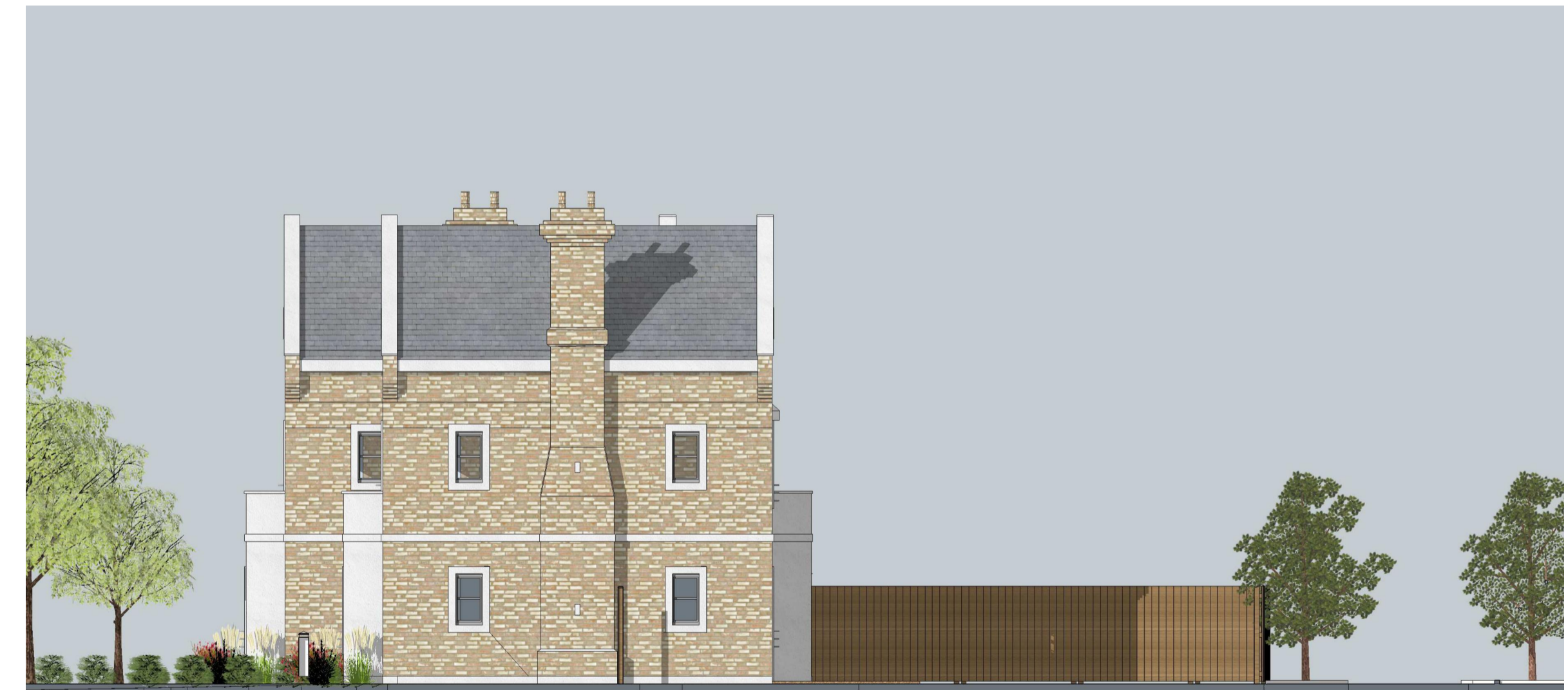
4 Proposed Side (East) Elevation